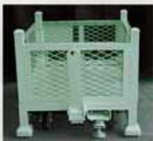
Bin 045 — Stackable basket with casters and tow bar