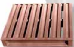
Pallet 007 — Heavy-duty double-faced steel pallet