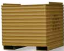
Bin 028 — Stackable corrugated steel container