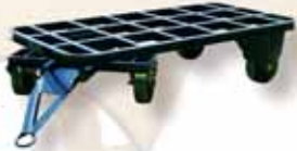
Rack 003 — Handling cart with steel grid base