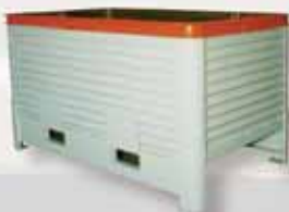
Bin 034 — Special-use corrugated steel container