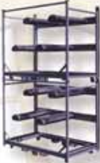
Rack 016 — Prong rack for tires in various production stages