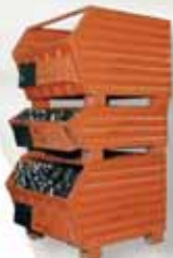
Bin 038 — Hopper-front corrugated steel container