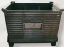
Bin 044 — Heavy-duty drop bottom box for aluminum company