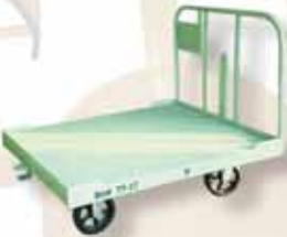
Rack 021 — General purpose cast-er cart