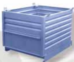
Bin 041 — Controlled-flow container (door closed)