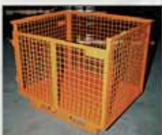
Bin 049 — Wire container w/ caster and conveyor runners