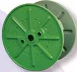
Reel 002 — 30" corrugated spool made of 1/4" steel/machined hubs