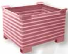
Bin 040 — Stackable corrugated container w/ special tiering legs