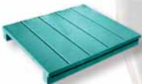
Pallet 010 — Single-faced universal pallet