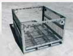
Bin 035 — Stainless steel parts handling/washing basket