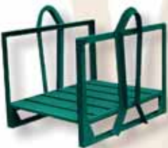
Rack 011 — Open-end hairpin tiering rack