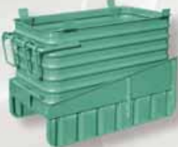
Bin 015 — Drop bottom container on skid base