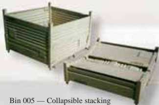
Bin 005 — Collapsible stacking container