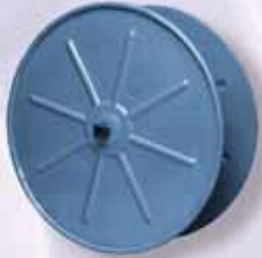
Reel 004 — 49" reel for handling fabric