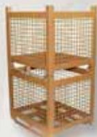
Bin 026 — HD Stackable wire mesh container