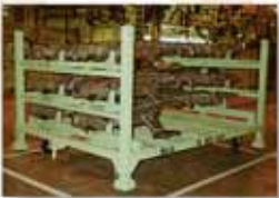
Rack 007 — Stacking rack with casters