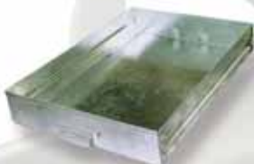
Bin 001 — Galvanized mini-load bin for AS/RS

Steel, stainless, aluminum, stackable, knockdown ... whatever the requirement. Each custom made container is precisely engineered using just the proper material and weld configuration needed for your specific manufacturing operation.