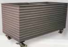
Bin 036 — Corrugated steel container w/ casters