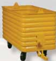
Bin 037 — Corrugated steel container w/ casters and rolover trunnion