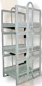
Rack 009 — Open-end tiering rack, hairpin design