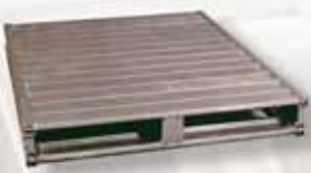
Pallet 001 — Double-faced aluminum pallet

For virtually any application that requires the toughness of metal, with many designed to be stackable and accessible by forklift from either side.