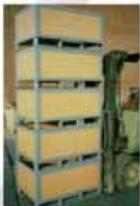
Bin 030 — Containers with steel base/ side frames and tri-wall sides for use in AS/RS