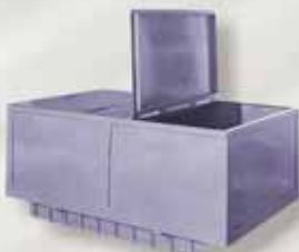
Bin 054 — Storage bin with hinged lid