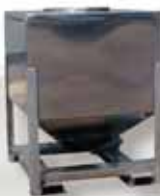
Bin 031 — All aluminum bulk-handling container