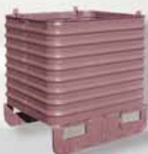
Bin 006 — Stackable corrugated steel container on skid base