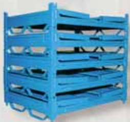
Bin 024 — Knockdown containers for automaker