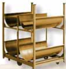
Rack 012 — Cradle rack for handling rolled materials