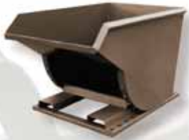
Bin 014 — Self-dumping hopper operates by gravity