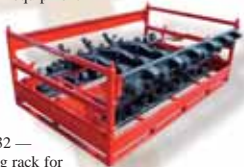
Rack 032 — Shipping rack for rear suspension auto parts