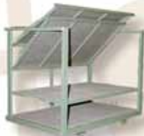
Rack 025 — Rack with spring-loaded shelves