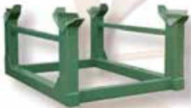
Rack 008 — Coil cradle built for aluminum producer