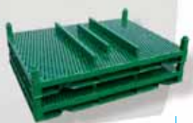
Pallet 016 — Large pin-pallet with runners for forklift loading of parts