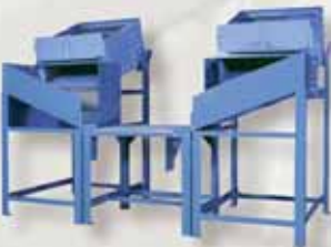
Bin 020 — Controlled-flow containers on workstation