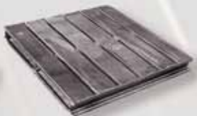
Pallet 004 — Double-faced slate pallet