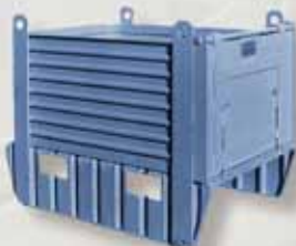
Bin 051 — Corrugated container w/ skid base, lift eyes, end door