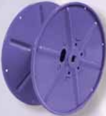
Reel 003 — Reel with heat-treated sides and chemical resistant epoxy paint