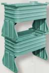
Bin 053 — Corrugated container with special skid base