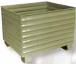
Bin 012 — Corrugated steel container, general use