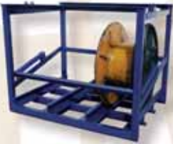
Rack 019 — Specialty rack for steel reels