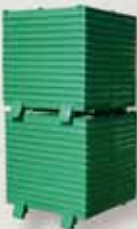
Bin 023 — Corrugated containers w/ unique feet and lids