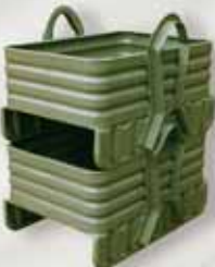
Bin 025 — Standard high-strength hairpin container