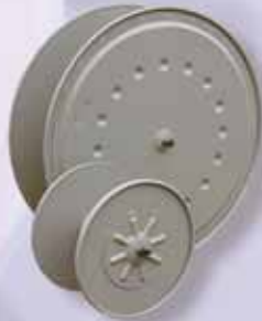
Reel 006 — 1500mm and 700mm HD steel spools