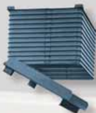
Bin 008 — Corrugated steel drop-bottom container