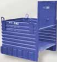
Bin 017 — Corrugated steel controlled-flow container