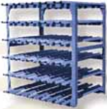
Rack 014 — Steel rack for work-in-process storage