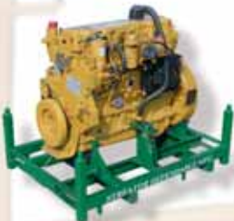
Rack 030 — Engine rack with quick-release lock