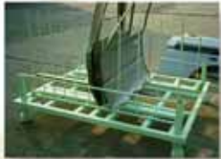
Rack 005 — Stacking/Handling rack for car doors