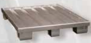
Pallet 003 — Aluminum pallet built for handling currency