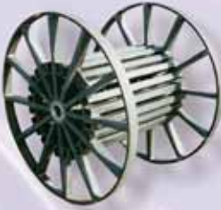
Reel 001 — Specialty spool for wire applications

For wire, fabric, plastic tubing, or whatever material you produce, we'll build reels from sixteen inch up to six feet diameter and anywhere in between, along with bases and cradles.