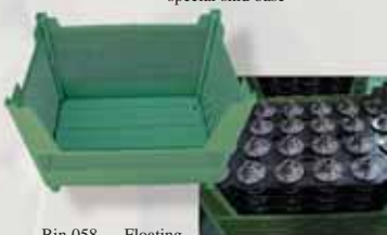
Bin 058 — Floating bottom container holds trays of auto parts