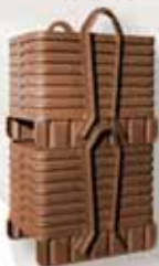
Bin 009 — Stackable hairpin containers with skid base