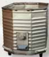
Bin 032 — Leak-proof stainless steel container