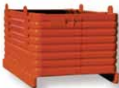
Bin 029 — Corrugated stacking skid box