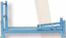
Rack 004 — Universal steel stacking rack with fold-down frames