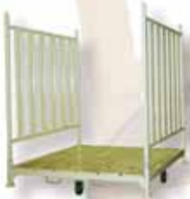
Rack 002 — Stacking rack with casters for handling rolled materials

Custom designed to be stackable, fold-down, with or without casters, and with the proper dunnage to hold your products safely and securely, we'll build racks for virtually any product from engines to castings to car doors to tires.