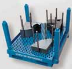
Pallet 015 — Multi-function pin pallet accepts an assortment of parts