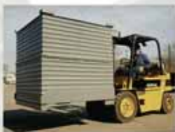
Bin 002 — Large drop-bottom box (60" x 60" x 60")