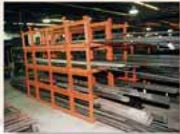
Rack 020 — Bar storage racks