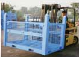
Bin 004 — Large stackable wire mesh container (4-way forklift entry)