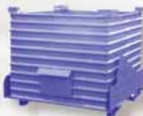
Bin 039 — Drop-bottom corrugated steel container