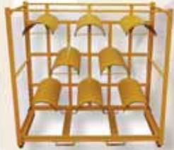
Rack 018 — Specialty rack for handling washing machine drums