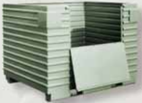
Bin 018 — Corrugated steel container w/ hinged side