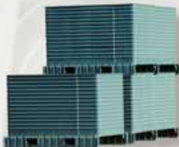
Bin 050 — Large corrugated containers w/ rollover fork channels