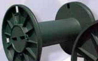
Reel 008 — Large 6' spool for holding plastic hose