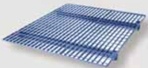
Pallet 008 — Steel grating cooling pallet for foundry application