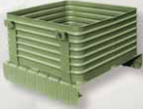
Bin 016 — Corrugated steel foundry tub w/ lifting eyes