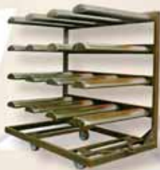
Rack 010 — Prong truck for handling uncured rubber tires