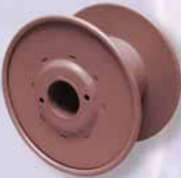
Reel 005 — Specialty steel spool for wire industry