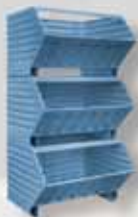
Bin 007 — Hopper front containers