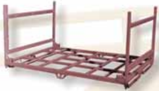
Rack 015 — Fold-down stacking rack built with various dunnage