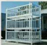
Bin 046 — Heat-treating container, coated w/ high temperature aluminum paint