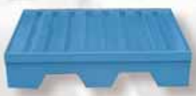
Pallet 002 — Corrugated steel pallet w/ 4-way forklift entry