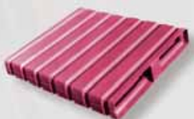
Pallet 006 — Corrugated steel double-faced pallet