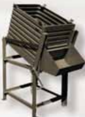
Bin 010 — Corrugated steel controlled-flow box and stand