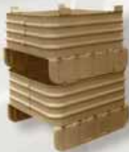
Bin 042 — Stackable corrugated steel parts container w/ skid base