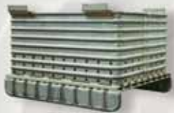
Bin 022 — Hot parts container