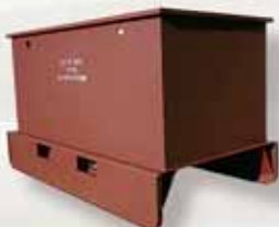
Bin 003 — Large scrap container for aluminum producer