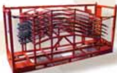
Rack 033 — Trim molding rack for auto industry