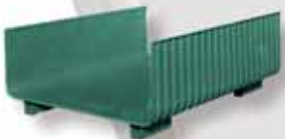
Pallet 005 — Fabric roll cradle for textile industry